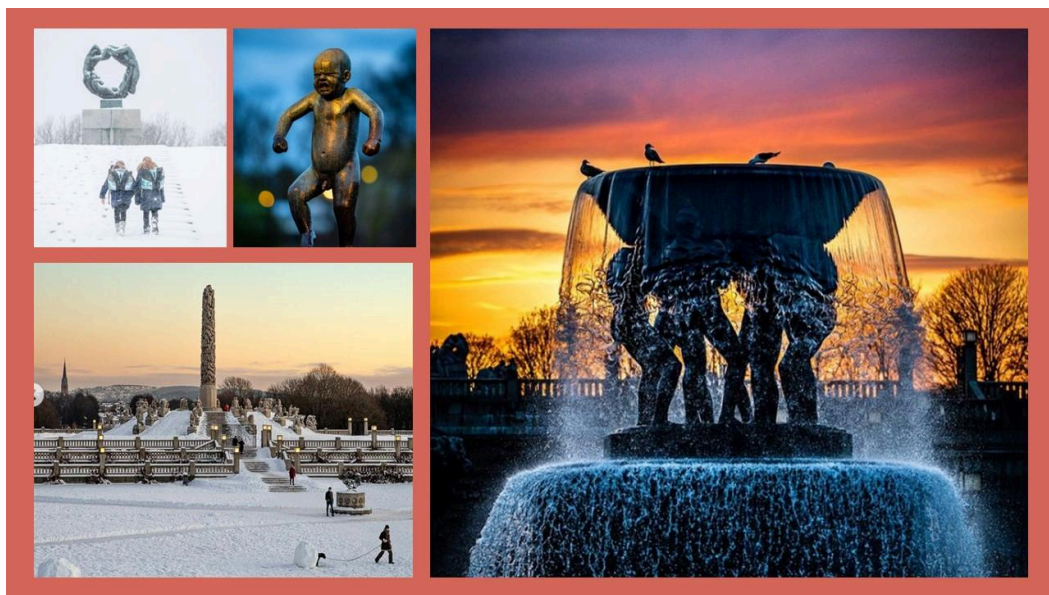
Vigeland Sculpture Park

Nature enthusiasts will be captivated by the numerous parks and green spaces scattered throughout the city. Vigeland Park, adorned with over 200 striking sculptures by Gustav Vigeland, is a testament to human emotion and connection.