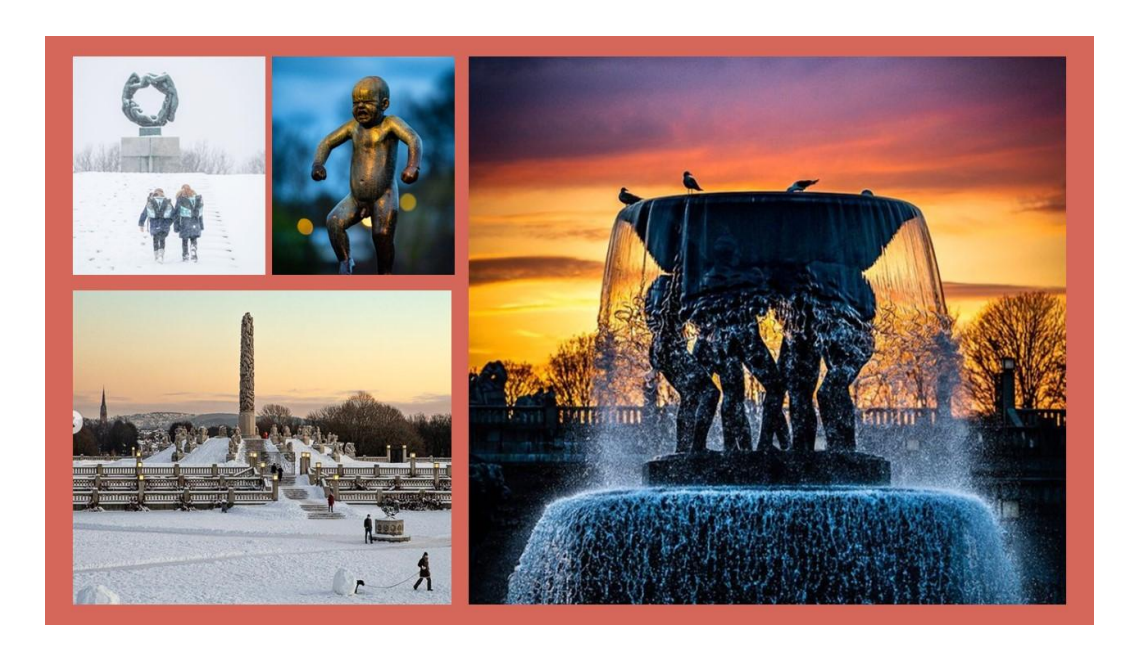
Vigeland Sculpture Park

The Oslo Opera House, with its unique architecture and panoramic views from the roof, is another must-see attraction.